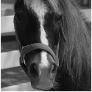
Pro – Animal of the Year

Description – The Shetland Pony is a small variety of horse. It has a stocky, muscular body with a shaggy coat. The coat can come in a variety of colors, but the most common are shades of black and brown. Pro’s coloring is called chestnut.